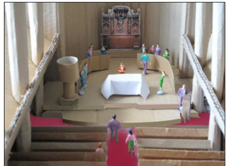
Watch for a scale model of Christ Church, which we'll use to help visualise ideas for our reordering.

We'll also be resuming discussion on our trial reordering at the east end. Yes, things have rather stalled over the last several months while other, more pressing matters have occupied everyone's attention, but the Archdeacon recently reminded us that our licence to carry out the trial reordering is time-limited. When it expires, we must either apply for a faculty (the Church of England counterpart of planning permission) to make the changes we want permanent or else put everything back as it was. To give us time to decide – and involve our new Priest-in-Charge, when appointed, who may well have views on the matter! – the Archdeacon's licence has been extended until 30 September 2016. Again, make sure you share your views!