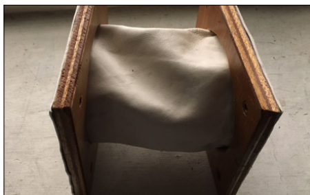
Nicholson's, our organ contractors, have replaced the defective part, so it should give many more years of service.