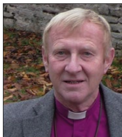
From the Rt Revd Peter Hancock, Bishop of Bath and Wells

When we go through dark times or difficult times, depressing times or perhaps even dangerous times, where do we look for help? For many of us it is to God we turn at those times. But we have to admit that sometimes this is a last resort, when we have exhausted all the other options. Sometimes it is out of sheer desperation that we call out to God.