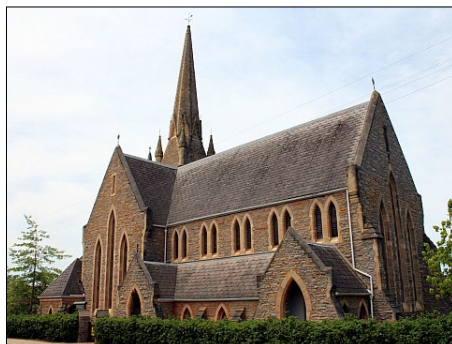
Christ Church, Grahamstown, as it is today...

Much like our own historic church, Christ Church, Grahamstown, is also a church of firsts: it has the first church spire to be built in Grahamstown, the first stained glass window to be painted in South Africa, and the first bell to be cast in Africa as one of a complete set of bells, not as a single bell. A sister church indeed!