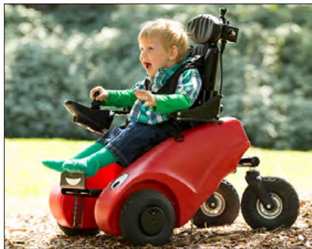
Wizzybugs are powered wheelchairs specially designed for under-five-year-olds.

For more about Wizzybugs and the loan scheme, visit www.designability.org.uk/product/wizzybug