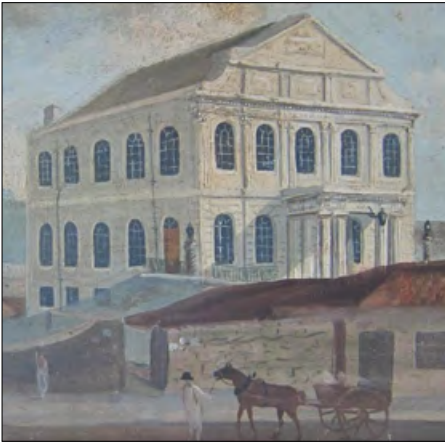
Walcot Chapel around the time it opened...

Nexus Methodist Church, Nelson Place East, Bath BA1 5DA (London Road, not far east of St Swithin's). Phone 01225 461509, e-mail churchoffice@nexusbath.org.uk Web: www.nexusbath.org.uk