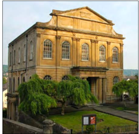
...And Nexus Methodist Church as it is today.