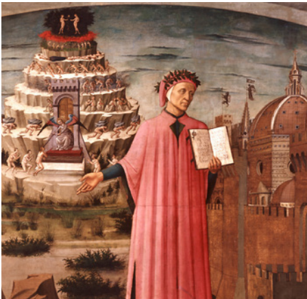
Dante, poised between the mountain of Purgatory and the city of Florence, in a detail of a painting by Domenico di Michelino, Florence, 1465.

If you have not tackled Dante, you have a treat in store. Poetry and spirituality seem deeply linked. There is much current interest in Dante and there are many translations available now.