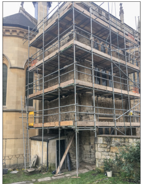
Top: our church architect, George Chedburn, clambered all around the building, including the tower roof. Above: the re-pointing of the north-east corner in progress.