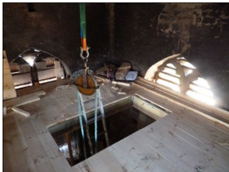
Above the new floor. The arches will remain open, letting the sound of the bells out when the trap-door is open.