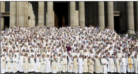
The "class of '94" celebrate with the Archbishop of Canterbury at St Paul's Cathedral in May.

You'll be well aware by now that 2014 marks 20 years since the first ordination of women