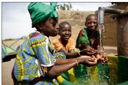
Young girls in Sanankoro village, Mali, practise good hygiene by washing their hands in clean water from their new water points.

For more on the organisation, what it does and how it is run, visit www.wateraid.org/uk/