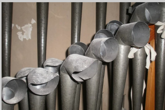
Some of the damaged pipes inside the organ

In early 2017 a large, heavy section of plaster fell from the wall above the organ, denting a large number of pipes, filling the organ chamber with plaster dust, and damaging some of the electrical components, making a lot of the instrument unusable.