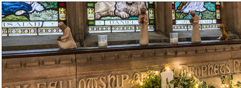
Each year, the three wise men symbolically traverse the window sills to pay homage to the Christ child.