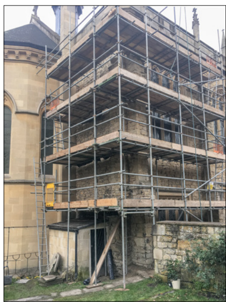
Top: our church architect, George Chedburn, clambered all around the building, including the tower roof. Above: the repointing of the north-east corner in progress.