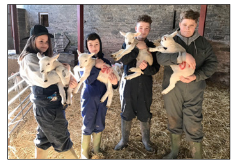
Jamie's Farm seeks to combine Farming, Family, Therapy and Legacy to assist the attendees in their daily lives.

Members of our Junior Church will be fundraising for Jamie's Farm during March and April. Keep a lookout in the notices for their fundraising escapades!